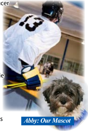
Abby: Our Mascot